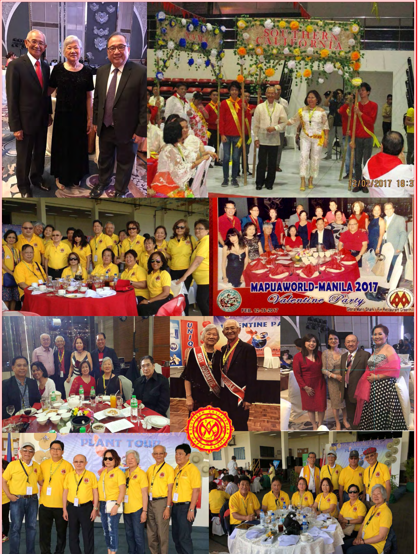
40th Anniversary Celebration