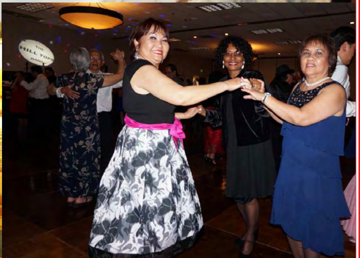
40th Anniversary Celebration