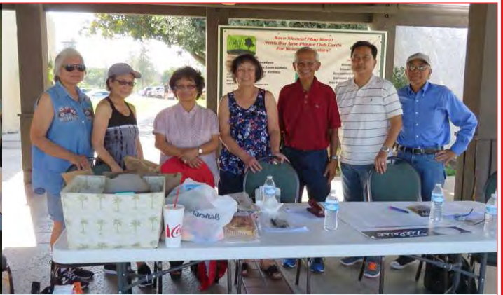
SCMA Annual Golf Tournament, August 6, 2016, El Prado Golf Courses, Chino, CA